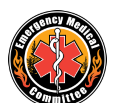
2023 Wildland Fire EMS Awards