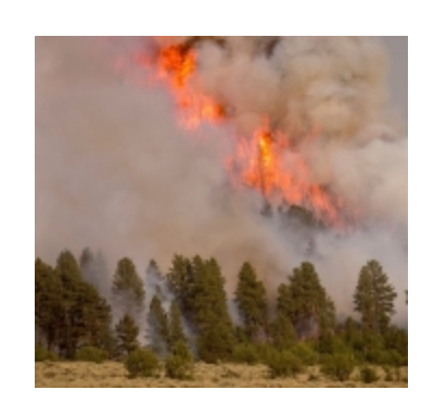
Memorandum 24-003: Removal of Type 1 Command and General Staff (C&G) Incident Position Qualification Pathways